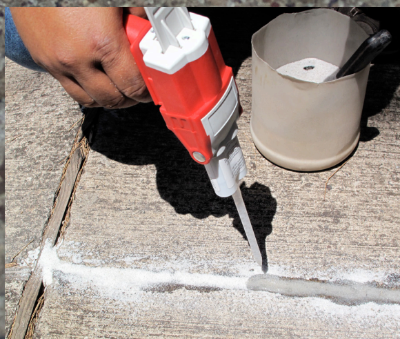
Repair walkways and patios.